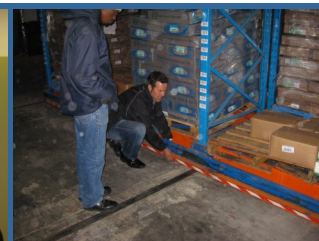
Onsite training provided by Barpro Storage

By having Barpro Storage provide operational and supervisory training on Storax Mobiles to your staff, you are not only boosting the workforce morale and organizational culture – but positively working on the longevity of the Storax Mobile System.